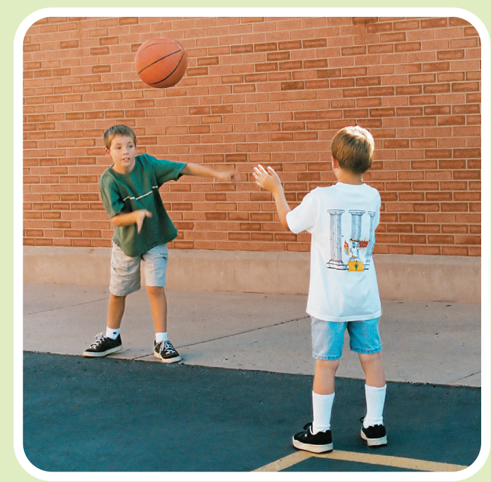
What do you do for exercise?