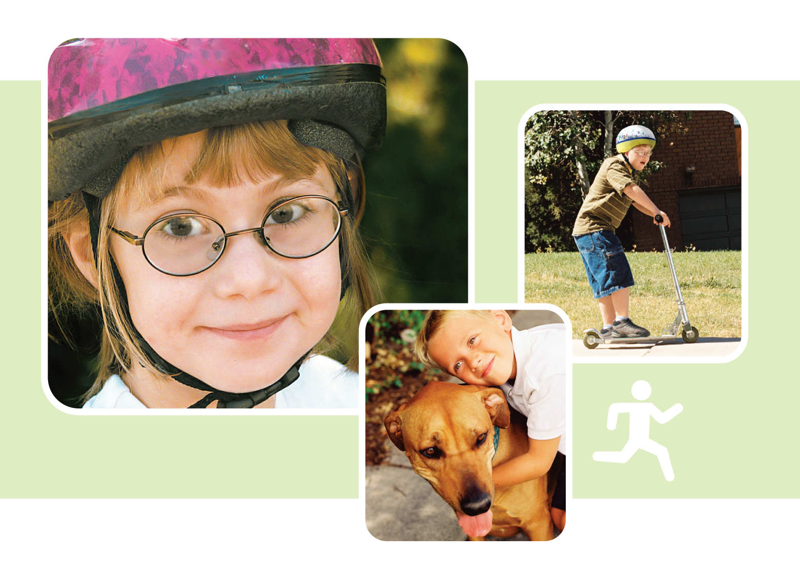
All of our bodies need to move, to run, to jump,