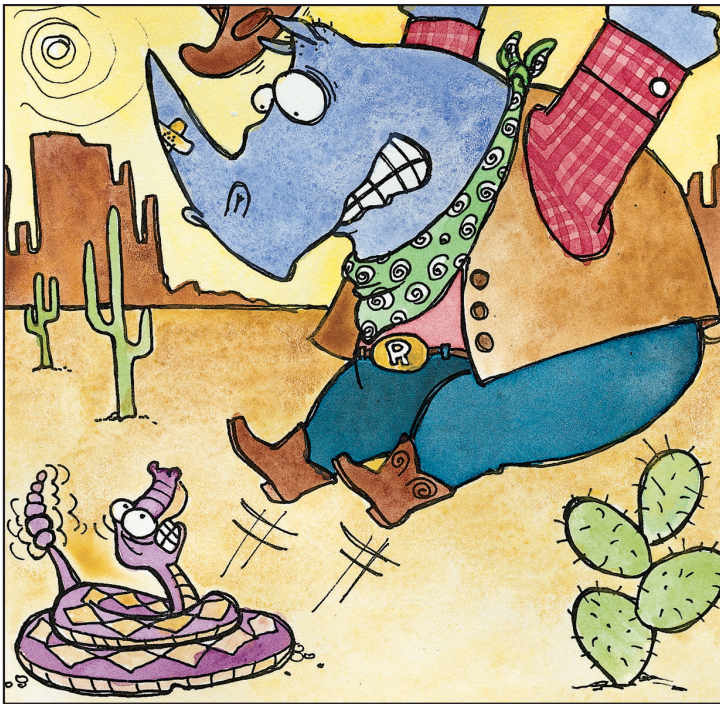
Hears a rattlesnake.