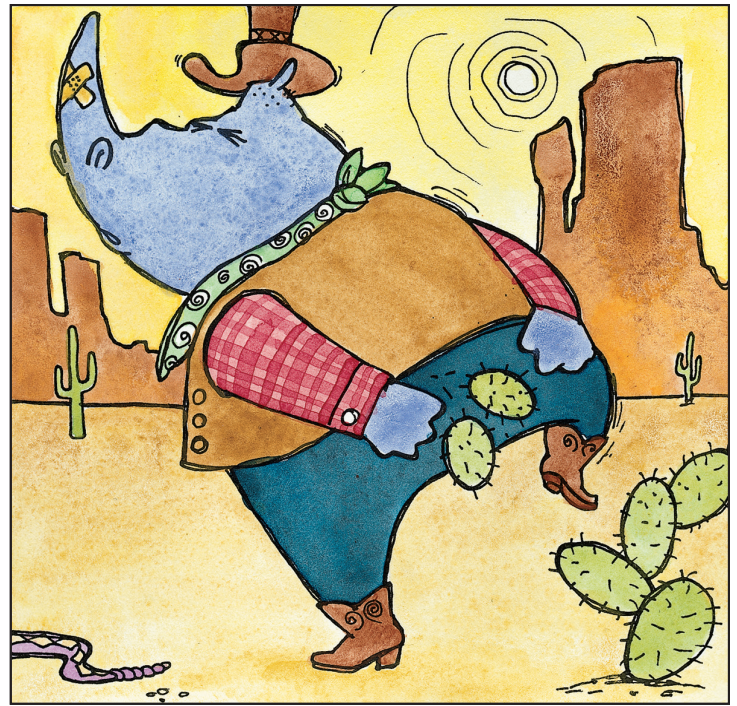
Rubs a rash.