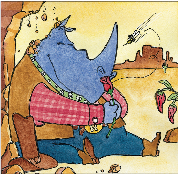
Smells a rose.