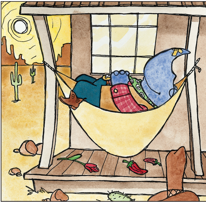
And rests at the ranch.