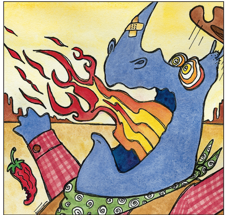
Tastes a red pepper.