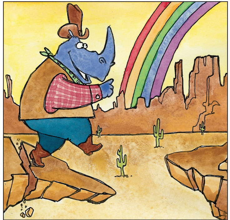
Sees a rainbow.