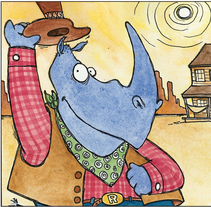
Rascal the Rhinoceros . . .