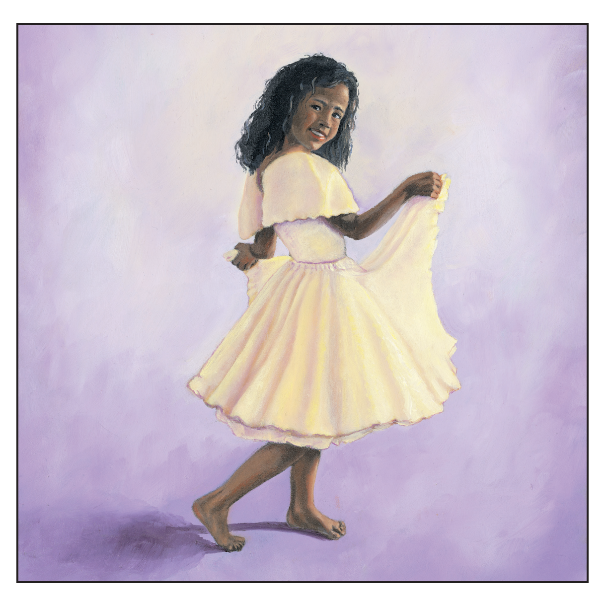
When I hear the music, I know just what to do. I move my feet and turn around the way it tells me to.