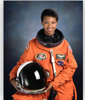
Mae Jemison in July 1992