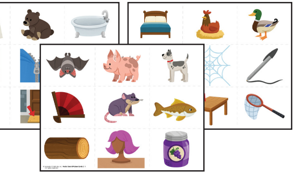
Example of Sound Sense Cards