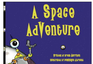
The story A Space Adventure helps your child count down from 10 to 0.

View example activities and more → here!