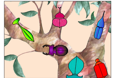
Your child creates a bug with different numbers of bug parts.